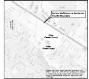
KEY MAP SCALE: 1" = 1,000'